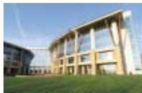
Corporate campus in Mooresville, N.C.

As Lowe's opened the doors to a new corporate campus in Mooresville, N.C., we entered the community as a committed partner, awarding a $2.5 million challenge grant to help construct a YMCA in Mooresville and a $2 million contribution for the Mooresville Library expansion.