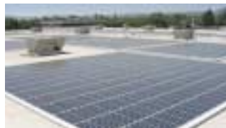
Our green power initiatives prompted the installation of a solar array to generate electricity for Lowe’s West Hills, Calif. store.

offered through our free Energy and Water Solutions Guides .