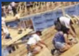
contributing to communities