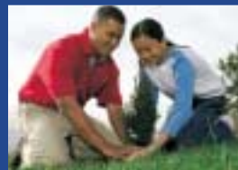
protecting the environment