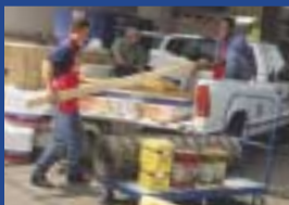
invigorating the economy