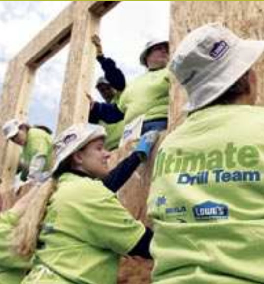
Women Build volunteers help raise a wall – Detroit, MI