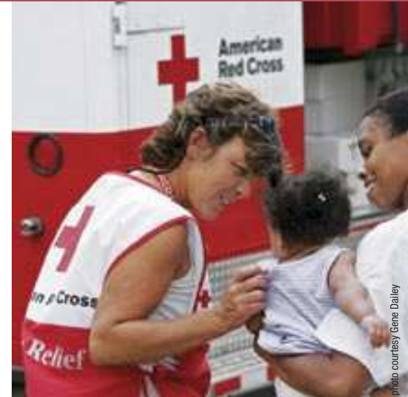
Red Cross hurricane relief efforts – Slidell, LA

the construction of approximately 1,200 homes in the region impacted by the December 2004 Indian Ocean Tsunami. Through Operation Home Delivery, Lowe's contributed all building materials for the framing and finishing of 60 homes to kick-off Habitat's long-term Gulf Coast rebuilding effort in the areas impacted by Hurricanes Katrina and Rita,