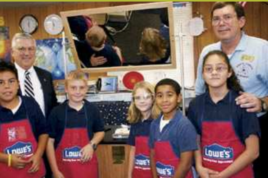
A $55,000 Lowe's grant helped supply mobile science labs for elementary science students – San Antonio, TX