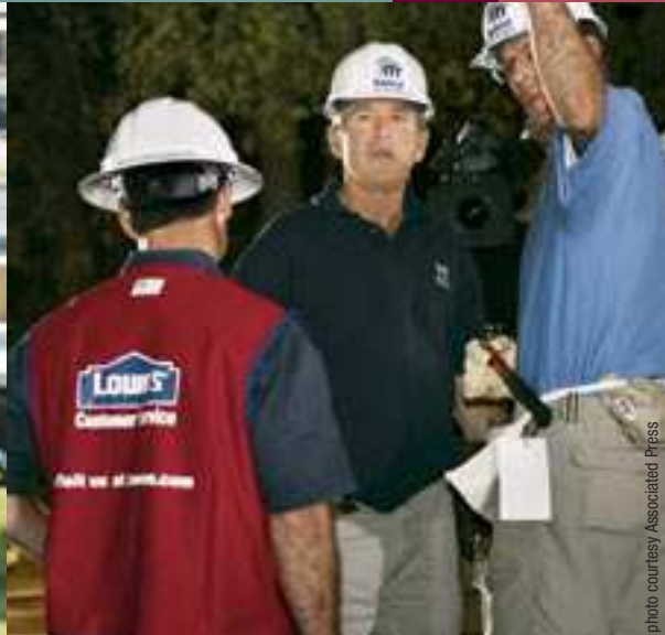
President George W. Bush and Lowe's volunteers, Operation Home Delivery – Covington, LA