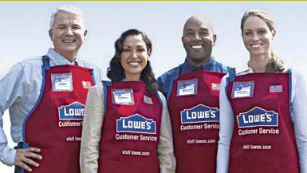
Lowe's store manager training program prepares employees for management positions.