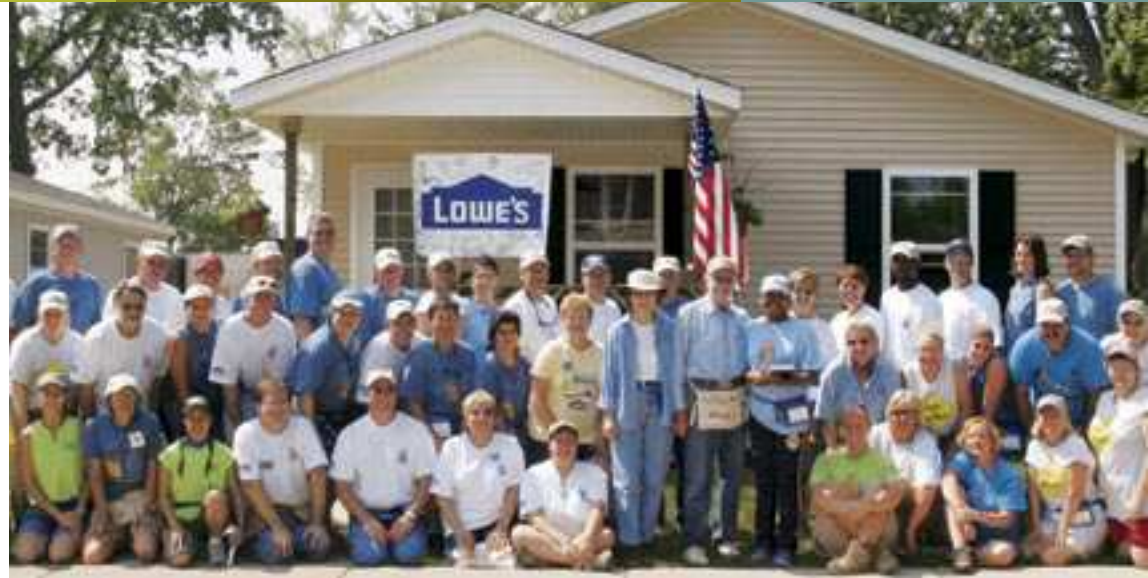
Jimmy Carter Work Project – Benton Harbor, MI

Habitat For Humanity Lowe's is a national partner with Habitat for Humanity International, helping to provide safe, affordable housing for thousands of working families. Lowe's, our customers and vendor partners contributed more than $8 million to Habitat projects in 2005, and Lowe's employee volunteers gave hands-on support