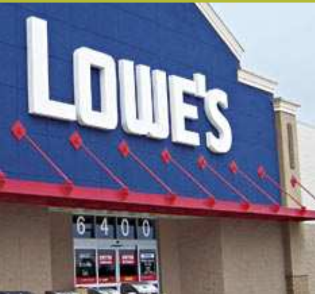
Lowe's LEEDS (Leadership in Energy & Environmental Design) Gold Award Store – Austin, TX