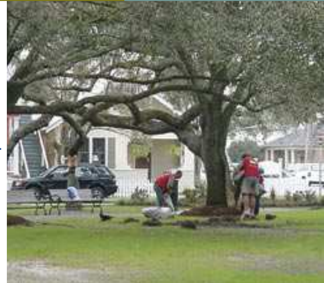
Employees volunteer through Habitat and Lowe's Heroes employee volunteer initiative – Pensacola, FL and Atlanta, GA

Jobs And Benefits Lowe's added 150 new stores and approximately 23,000 jobs in 2005, helping boost local economies with jobs and tax benefits. Employees are rewarded with competitive pay, comprehensive benefits (including medical benefit options for full- and part-time employees), 401(k) matching, a discounted stock purchase program and a store discount. Nearly 75 percent of positions