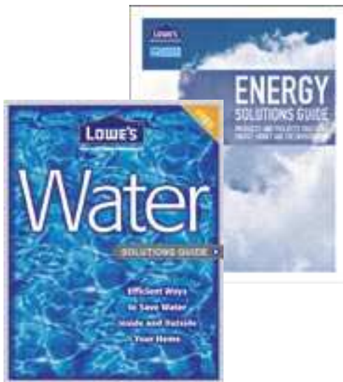
Energy & Water Solutions Guides – free at Lowe's stores