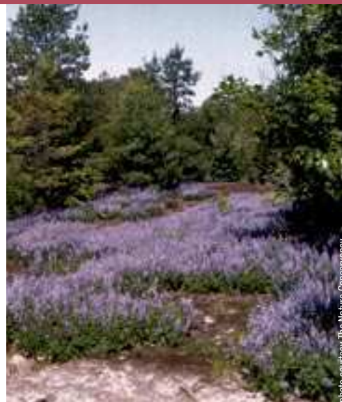
A $1 million Lowe's grant will assist preservation efforts of The Nature Conservancy – Newmarket, NH

and native plant species to assist in drought-prone environments. ENERGY STAR® Lowe's has been an award-winning ENERGY STAR partner for four consecutive years. These honors from the U.S. Environmental Protection Agency and Department of Energy are for promotion of ENERGY STAR-qualified products meeting the highest water and energy-