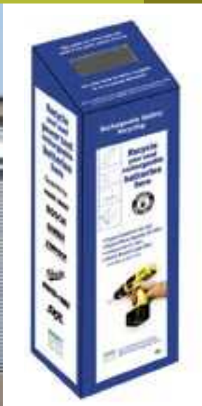
Customers recycled 87,000 lbs. of batteries through collection boxes at Lowe's.