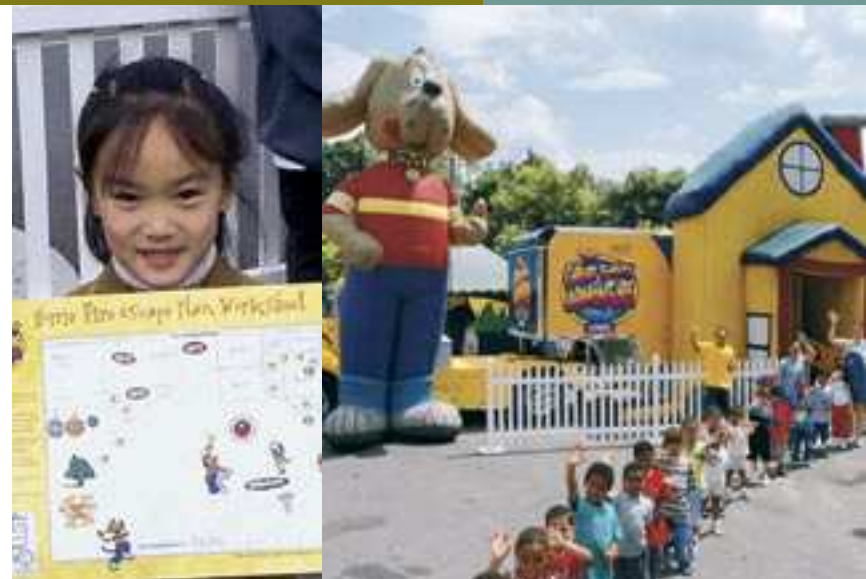
The Home Safety Council's Great Safety Adventure brought home safety tips to kids at more than 360 locations, including Lowe's stores, schools and special events – Mooresville, NC

Lowe's Charitable And Educational Foundation Since 1957, LCEF has been dedicated to improving the communities we serve through support of public education, community improvement projects and the environment. In 2005, LCEF awarded more than $13 million to nonprofit organizations. Toolbox For Education Launched in