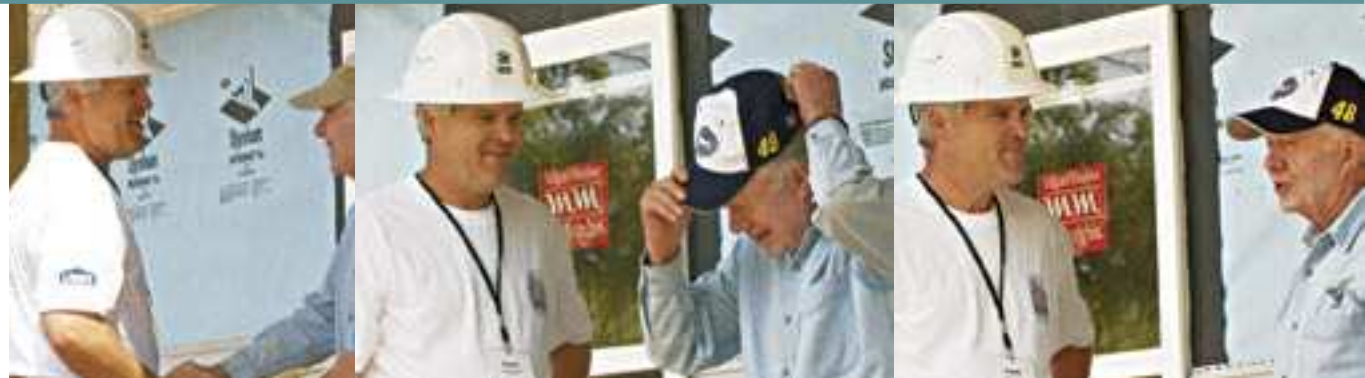
Chairman, President and CEO Robert Niblock with former President Jimmy Carter at Habitat for Humanity’s Jimmy Carter Work Project – Detroit, MI