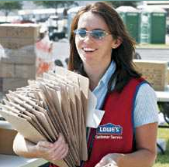
Lowe's volunteer assists with relief efforts at the Astrodome – Houston, TX