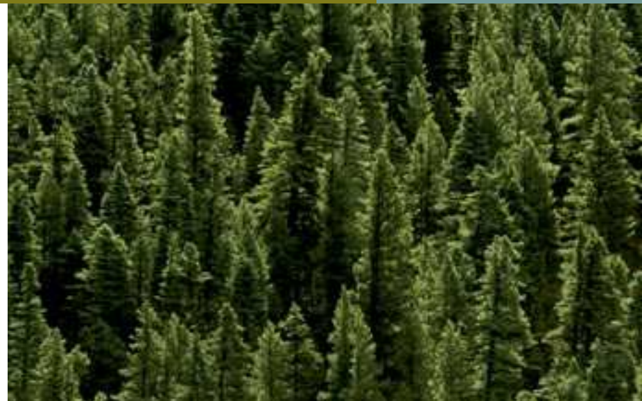
The EPA estimates Lowe's annual purchases of green power prevent CO 2 pollution equivalent to the planting of more than 3,000 acres of trees.

Eco-Conscious Building And Store Practices With more than 1,234 stores nationwide, we challenge ourselves to raise the bar with responsible practices in our store construction and operations. Through “cool roof” technology and use of high-efficiency fluorescent lighting, air conditioning and heating units, we're striving to reduce our stores' energy consumption.