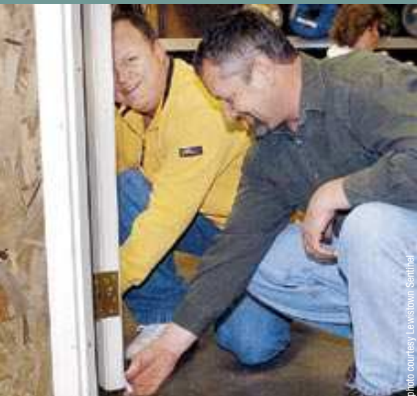
United Way volunteers come to Lowe's to learn winter weatherization tips to assist area residents – Lewistown, PA