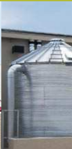
Tanks collect rainwater for plants in the garden center – Austin, TX